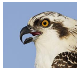
Osprey, Pandion haliaetus