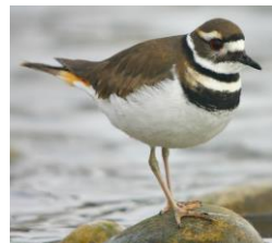
Killdeer, Charadrius vociferus