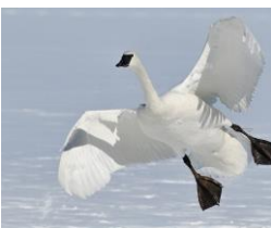
Trumpeter Swan, Cygnus buccinator