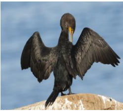
Double-crested Cormorant, Phalacrocorax auritus