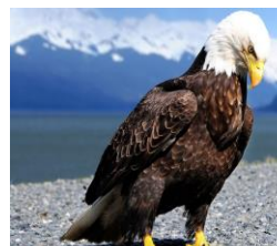
Bald Eagle, Haliaeetus leucocephalus