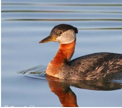
Red-necked Grebe, Podiceps grisegena