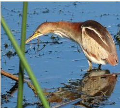
Least Bittern, Ixobrychus exilis