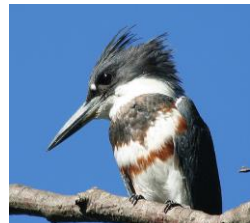
Belted Kingfisher, Ceryle alcyon