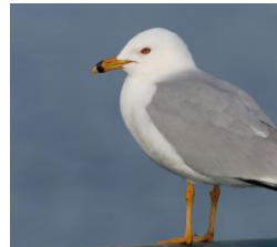
Ring-billed Gull, Larus delawarensis