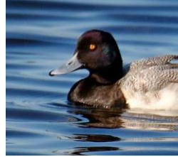
Lesser Scaup, Aythya affinis