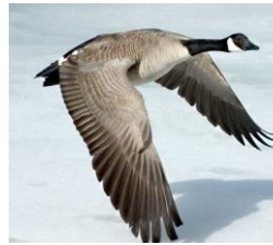
Canada Goose, Branta canadensis