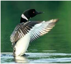
Common Loon, Gavia immer