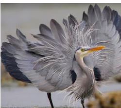
Great Blue Heron, Ardea herodias