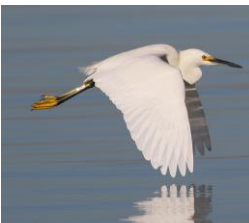
Snowy Egret, Egretta thula